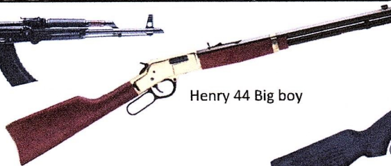
Henry 44 Big boy