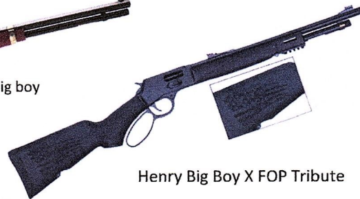
Henry Big Boy X FOP Tribute