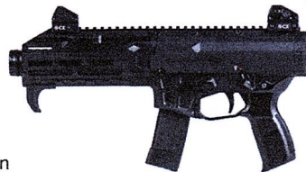
CZ USA Scorpion Evo 3 51 9mm