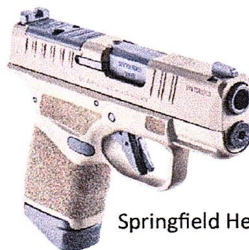
Springfield Hellcat 9mm