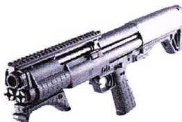
Bullpup 12 Gauge Shotgun