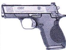
S&W M&P EZ9mm