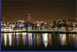
Long Beach skyline