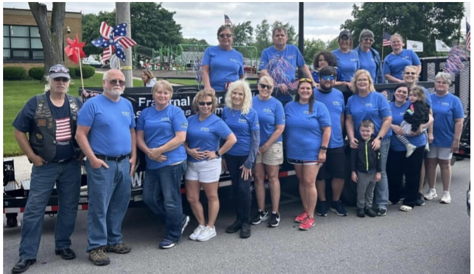
Lima Lodge #8 members at local Memorial Day Parade