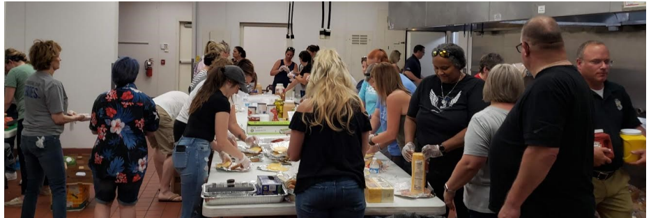
FOPA Lodge #5 members helping to prepare meals for the officers working during the riots